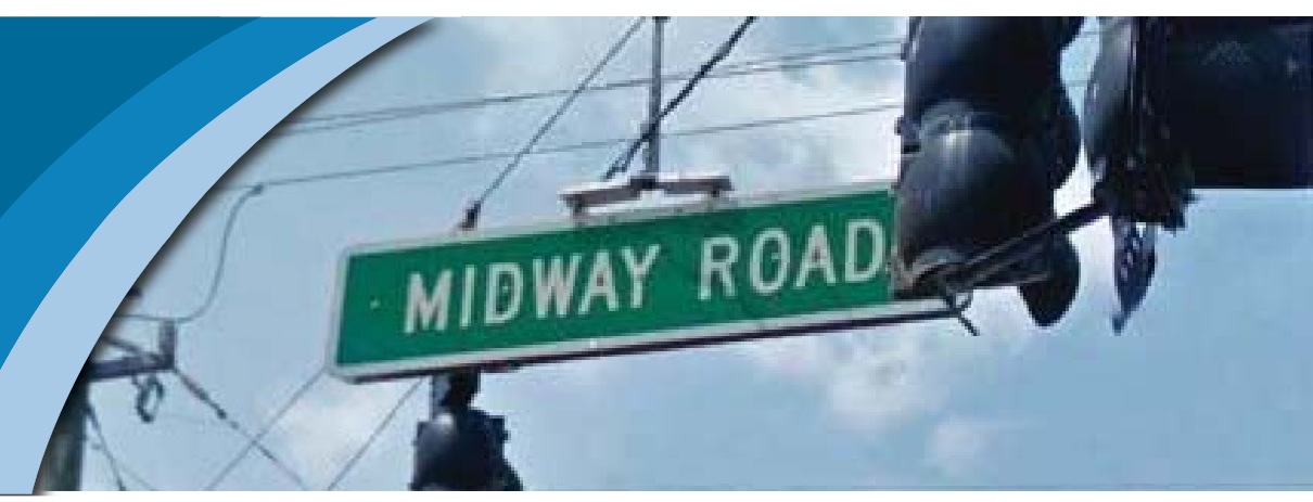
Midway Road (712) Recommended Bridge Typical Over Florida's Turnpike